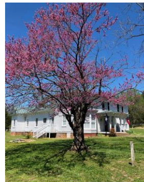
Answer to December “Where Am I” (above) This is Trevilian Station Battlefield in Virginia